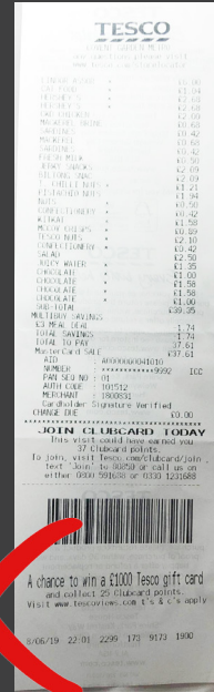
Ensure the image is not over exposed.