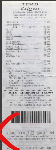
Avoid writing on receipt or any pen markings across it.