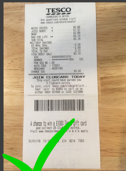
A well exposed flat image with all key areas clearly framed within the image.