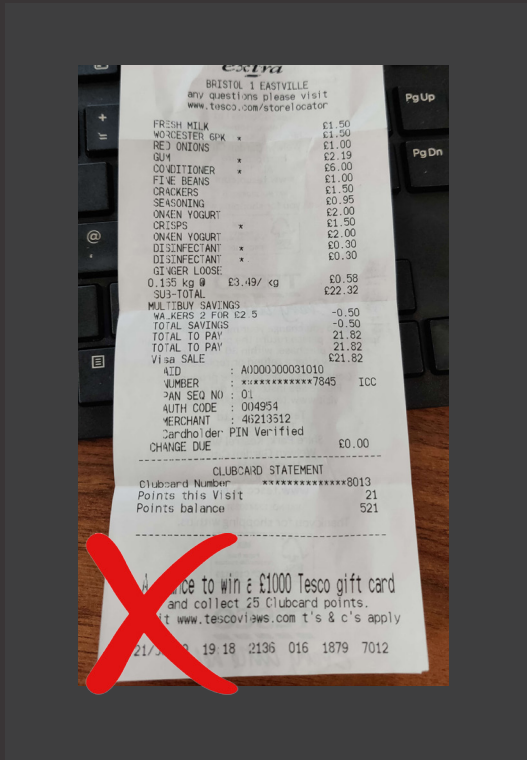
Ensure entire receipt is in the image and that no key areas are cut off.