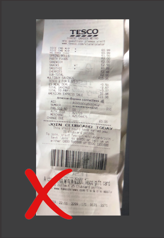
Hold camera still to avoid blurred images.