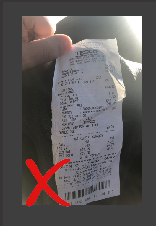
Do not crumple receipts after shopping and ensure that receipt is flattened out.