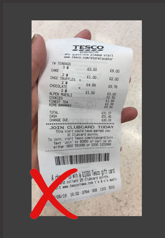
Place receipt on a flat surface and do not take hand held photos.